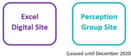
Figure 2: Organisational structure showing business units included and excluded

Excel Digital is one legal entity 100% owned and controlled by the Managing Director. The business had two sites in the Financial Year Ending 31 March 2021. The Perception Group site was a previous print site which was leased for storage until the end of December 2020.